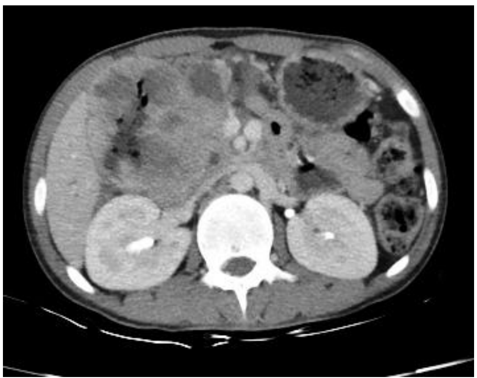
Fig 1: Contrast Enhanced CT image of abdomen with arrow showing thickening in the wall of duodenum with multiple hypodense areas within suggestive of internal areas of necrosis.